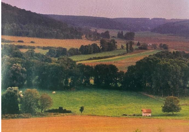
Several parcels in Magry...